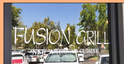
A whole crowd of Village members, volunteers and guests joined our Meet & Greet at Fusion Grill in the photos below.